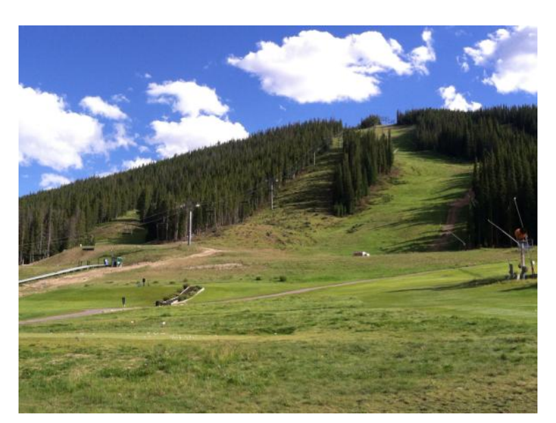
Super Bee Lift area at Copper without snow. That is a stairway in the center.