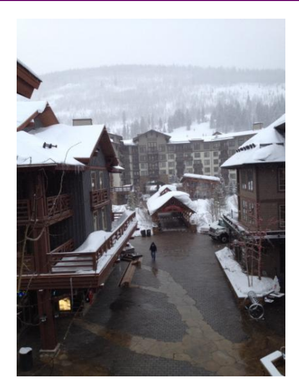
Picture yourself crossing the covered bridge while conveniently lodging in Copper's Center Village.